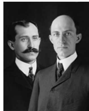
THE WRIGHT BROTHERS