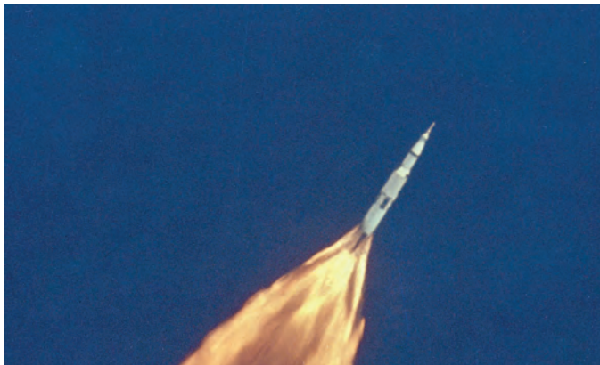
The launch of the rocket into orbit