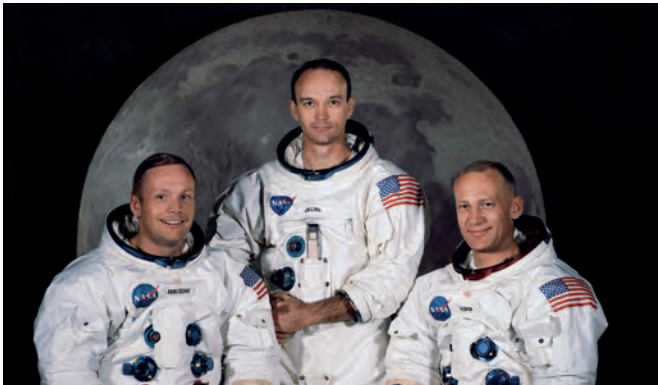
The crew of Apollo 11

Using books or the Internet, find out an interesting fact or write a descriptive noun phrase to go with the pictures below from the Apollo 11 space mission.