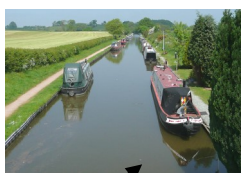
Shropshire Union Canal

*use symbols and keys (including the use of Ordnance Survey maps), to build their knowledge of the United Kingdom and the wider world.