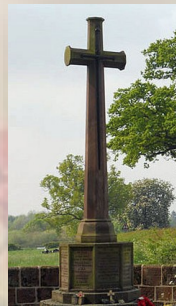
Leaton War Memorial