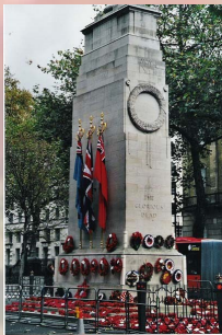
The Cenotaph, London