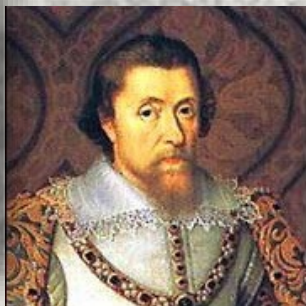
King James I