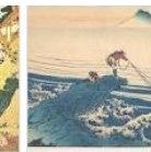
Kajikazawa in Kai Province