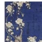
Bullfinch and weeping cherr...

mix colours effectively using the correct language use inspiration from famous artists to replicate a piece of work; reflect upon their work inspired by a famous notable artist and the development of their art skills; express an opinion on the work of famous, notable artists and refer to techniques and effect