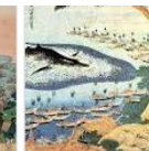
Oceans of Wisdom