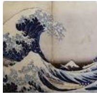
The Great Wave off Kanagawa