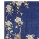
Bullfinch and weeping cherr...

offer facts about notable artists', artisans' and designers' lives;