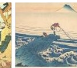
Kajikazawa in Kai Province