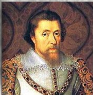
King James I