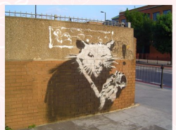
Rat in London