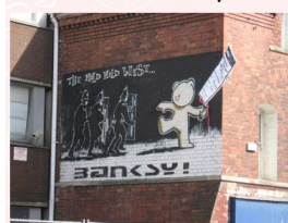
Mild Mild West, 1997